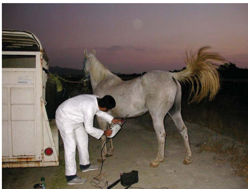
Fig. 3. Capture of blood-feeding insects by direct removal from the host using a mechanical aspirator. (Online figure in color.)

Semiochemical or light baited traps are further limited in that some biting insects may not readily be collected in them. Mullens and Dada (1992a,b) noted that bird-feeding, mostly cactiphilic Culicoides in a southern California desert mountain habitat were rare in \text{CO}_2 -baited (dry ice) traps, but were abundant at light or could be collected using birds as bait. Dry ice-baited suction traps release amounts of \text{CO}_2 (500–